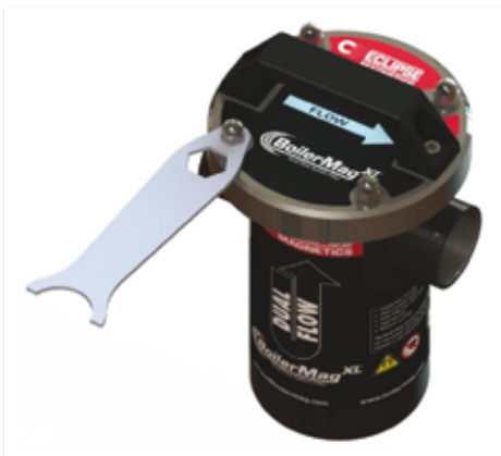
Unscrew and Remove Domed Nuts / Washers