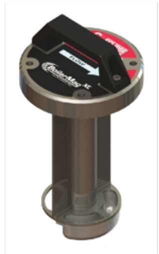
Magnet Core Assembly