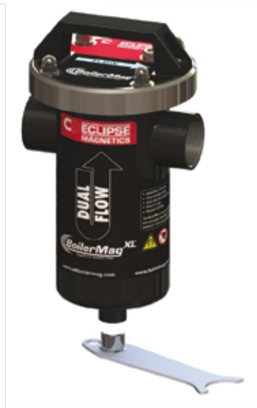
Remove Drain Plug