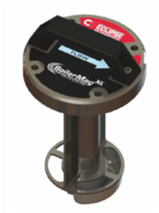
Remove Core from Body