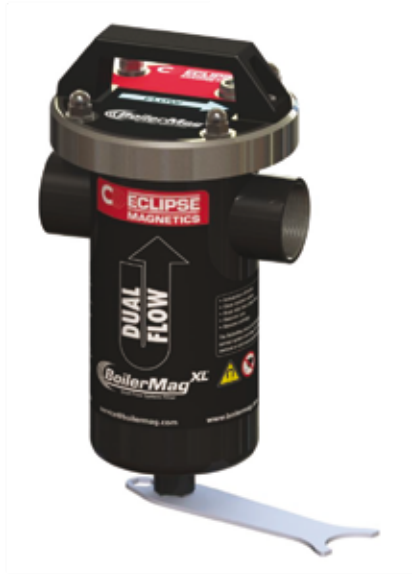
Loosen Drain Plug using Tool Provided